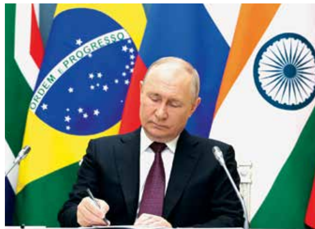
Russian President Vladimir Putin attended the BRICS Summit via video connection.

Zepp-LaRouche: The answer to the first question is, definitely, yes. I think there is nothing in the world which will stop this, except World War III, which would not be to the benefit of even those who start it. Because this is now gaining a momentum, as I wrote in my