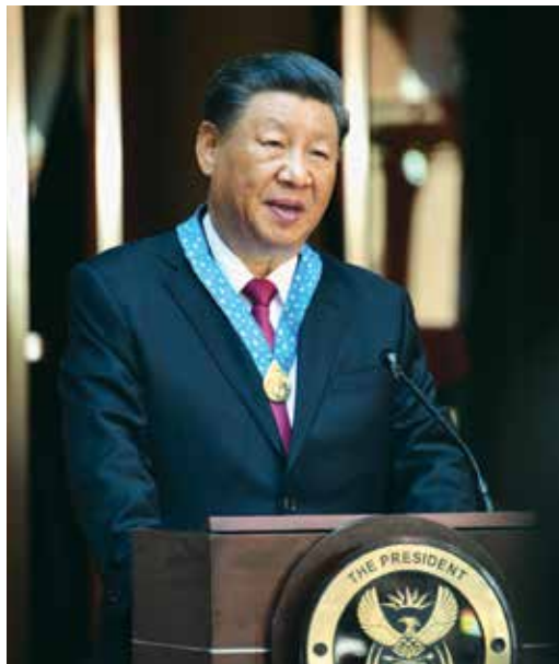
Xi Jinping, President of China, addresses the BRICS Summit.

Now, much of the opening day of the BRICS summit yesterday was taken up with discussion of the role of