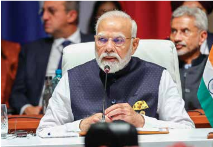
Press Information Bureau