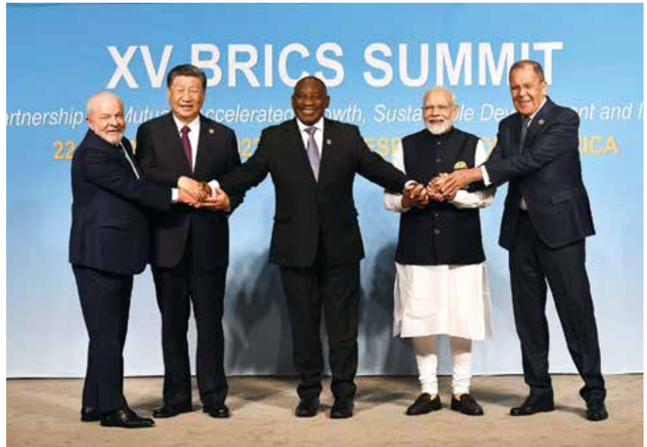
Meeting at the historic 15th BRICS Summit in Johannesburg were (left to right): Luiz Inácio Lula da Silva (Brazil), Xi Jinping (China), Cyril Ramaphosa (South Africa), Narendra Modi (India), and Sergey Lavrov (representing Vladimir Putin, Russia), Aug. 23, 2023.