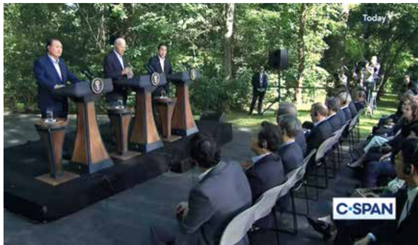
In an effort to counter China, U.S. President Joe Biden invited Japan's Prime Minister Fumio Kishida (right) and South Korea's President Yoon Suk Yeol (left) to meet at Camp David, Maryland, where they agreed to deepen military and economic cooperation. Aug. 18, 2023.

I think the genie is out of the bottle. There had been efforts for an extended period to conceal all of these conditions, but the train has left the station. If you listen